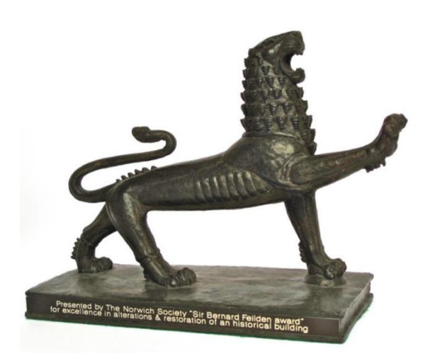
The Sir Bernard Feilden Conservation Architecture Award

Following the decision to link the Society's awards scheme with that of the Norfolk Association of Architects and Civic Voice, the inaugural Design and Craftsmanship Awards were held in autumn 2019. The DCA awards aim to celebrate building projects throughout Norfolk which positively affect our built environment, with categories including both new-build projects and conservation work.