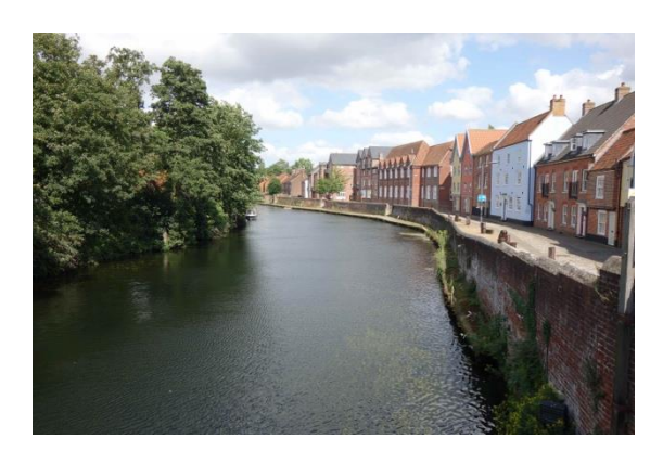
Fye Bridge, downstream summer

In 2020, The CEC created a report assessing views from River Wensum bridges and strategic views of the city centre with the intention to encourage the City Council to protect them. Views were documented in both summer and winter as a matter of record, and the report can be read on the Society's website.