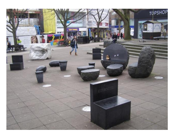
Seating at Hay Hill