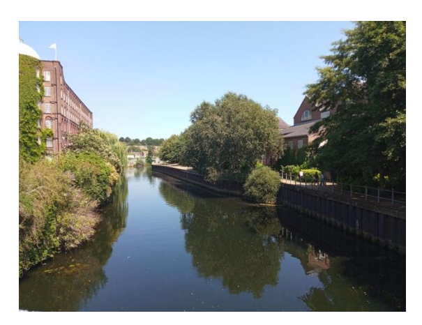
Whitefriars bridge, downstream summer