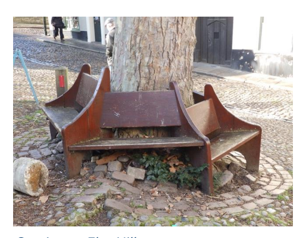
Seating at Elm Hill

alongside an atlas showing the location, nature and capacity of the seating.