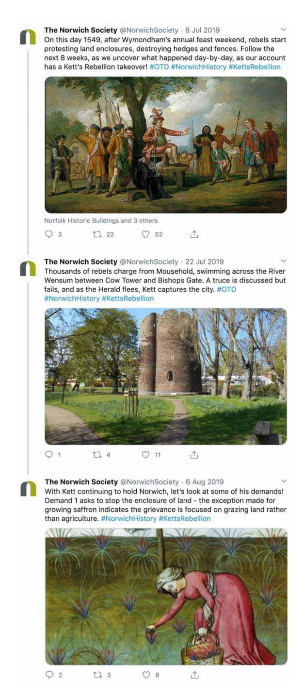
Part of the Kett's Rebellion Twitter series

Kett's Rebellion in 2019 and a series looking at Norwich's architectural features running across 2020 were particularly well received.