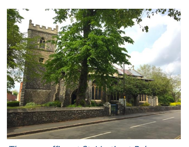
The new office at St, Martin at Palace Plain

In spring 2020, the Society was asked to vacate the Assembly House premise, and a new office was found at St. Martin at Palace Plain owned by the Norwich Historic Churches Trust. The current office address is now St Martin at Palace Church, 15 St Martin-at-Palace Plain, Norwich, NR3 1RW.